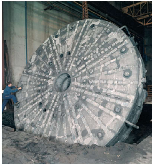
Fig.2 – Corofen PREMIUM E1

N.B.: it is absolutely essential to avoid direct contact between resins and acids in absence of sand.