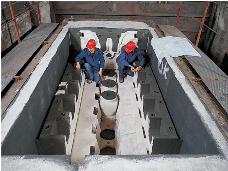
Fig. 1 – Corofen PREMIUM EM1

Corofen binders are very versatile and perform very well for use with big iron castings, where a long bench life is required. They also have a high thermal resistance and are therefore recommended when heavy sections are involved as in the case of die or balance weight castings.